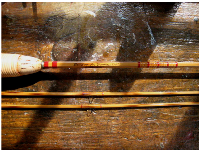
"Bamboo for Brookies" Custom Bamboo Fly Rod