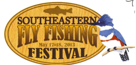
SOUTHEASTERN FLY FISHING FESTIVAL

Several other events are on the horizon. The Federation of Fly Fishers – South East Council (FFF-SEC) will be holding the Fly Fishing Festival on May 17-18. More information can be found on their website southeastfff.org . Remember, a joint fundraising effort between our Chapter and FFF-SEC will be conducted on Friday, May 17 to raise funds for brook trout restoration in the Park. We hope to see you there.