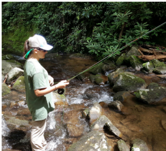
Trout camper fishes in a Smokies stream.

Fly fishing for trout in the Great Smoky Mountains is the focus of the ninth annual GREAT SMOKY MOUNTAINS TROUT ADVENTURE CAMP for middle school girls and boys, sponsored by the Tennessee Council of Trout Unlimited.