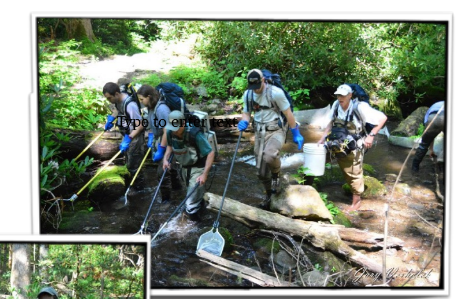
Thanks to the volunteers who helped make those samples happen.

Large Stream Samples were also completed on three streams this month – East Prong of Little river, West Prong of Little River, and Abrams Creek.