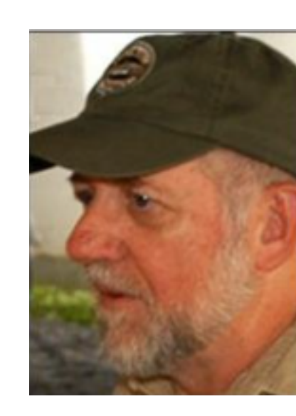
SOUTHERN FLYFISHING HALL OF FAME BRYSON CITY, NC MAY 2023

Materials needed are: Hook - Size 14, 1X long dry fly Parachute post material - white poly yarn or white calf body hair Tail and Parachute Hackle - light ginger hackle Dubbing - light cahill, cream, or pale yellow-orange Thread - light cahill and red, size 6/0 or 8/0 Head Cement or Superglue