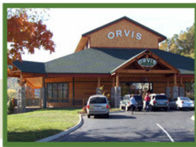
Orvis Retail Store Sevierville, Tennessee