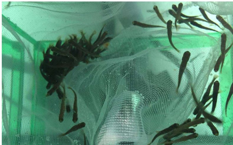
Fry getting released from the egg basket at the Episcopal School tank

All of our 8 schools have released their fry into the tanks and are now able to take the front insulation off the tank in order to see their fish during the day. Since the eggs and alevins are sensitive to light, the only way they could see into the tank was through a small window cut in the insulation that they opened occasionally to view the progress. For our younger students, that meant a stool and a lot of stretching to see in.