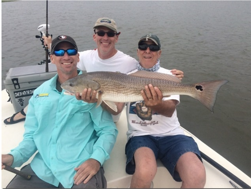
Eustis & Sons off the Carolina Coast

Road Trip: A chilly day on the White for me, November 17 th , but warmer on the San Juan, November 20 th