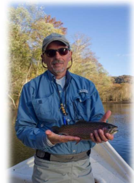
Caney Fork Bow

Well, it's that time of the year to elect the Little River Chapter Board of Directors at the December 1 meeting. After four years as Chapter president, I will be rotating out