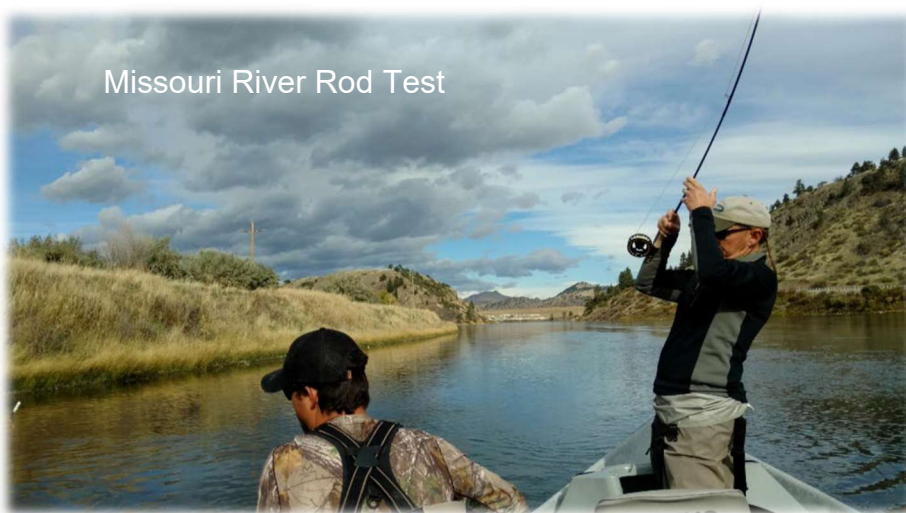
Missouri River Rod Test